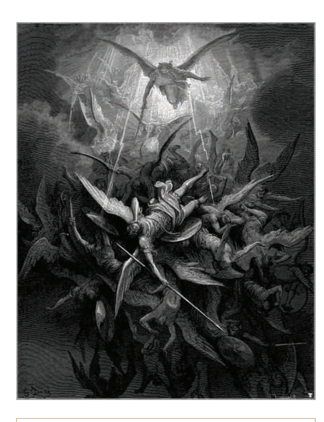
Illustration of Satan being cast out of heaven (by Gustave Doré for John Milton's Paradise Lost . 1866)

Art: Gustave Doré. French illustrator, sculptor, artist, and engraver Doré (1832–83) has illustrated Paradise Lost . Doré's images can reinforce the power of Satan to destroy and deceive.