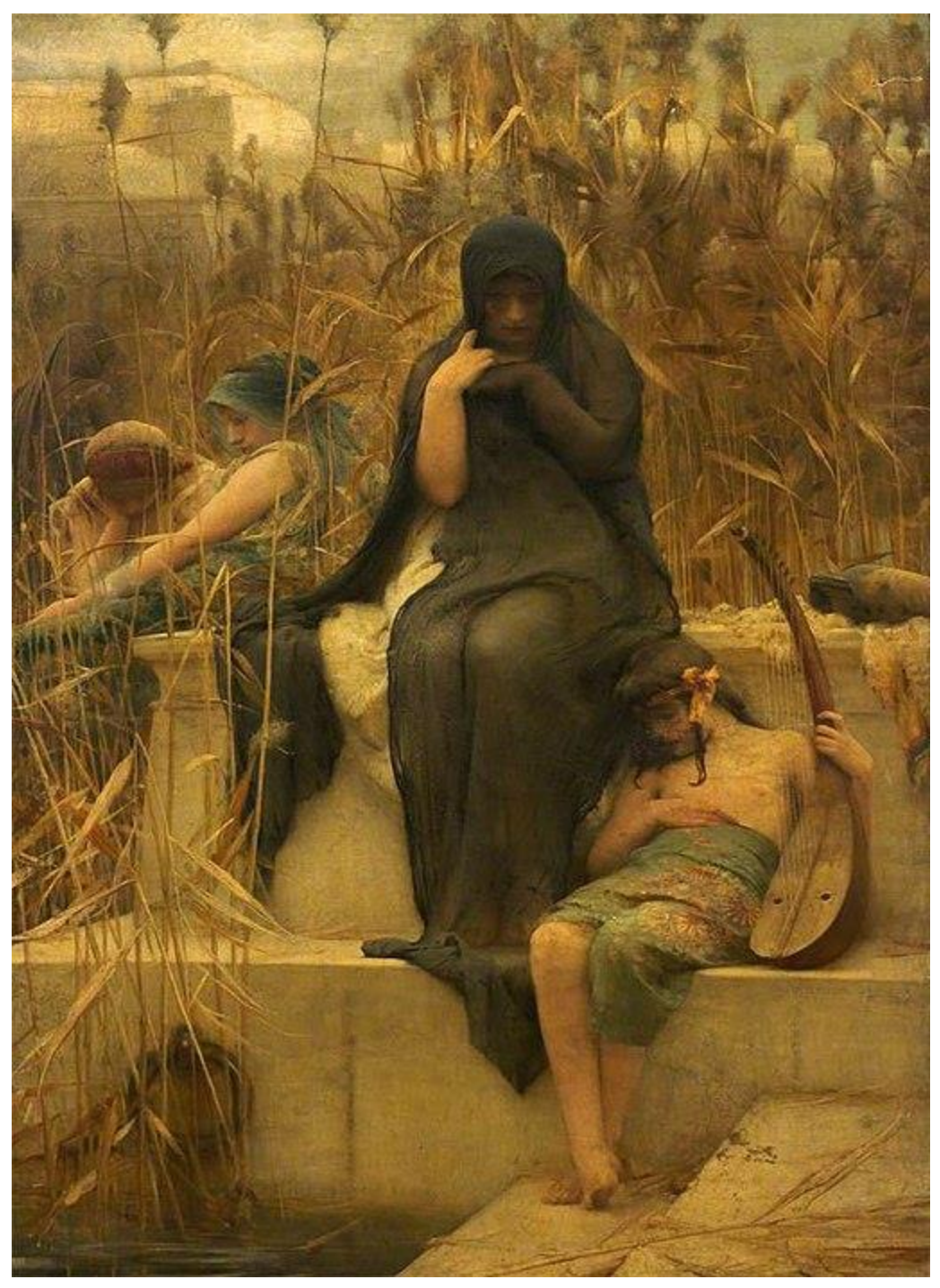
Figure 1Arthur Hacker: By the Rivers of Babylon.

• It is equally important to have a look at our own history, the atrocities, the