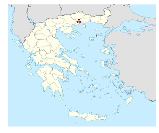
Figure 1. Map of Greece with the location of Philippi.

❖ PHILIPPI (PLACE). Situated in Northern Greece at the border of Eastern Macedonia and Thrace, ancient Philippi was the site of Paul's earliest extensive missionary activity in Europe (Acts 16:11–40; Letter to the Philippians). The city stood about 16 km Northwest of the port city Neapolis (Acts 16:11, 12; modern Kavalla) and originally bore the name Krenides (from the Greek for "spring") in recognition of the abundance of streams (Acts 16: 13) in the area.